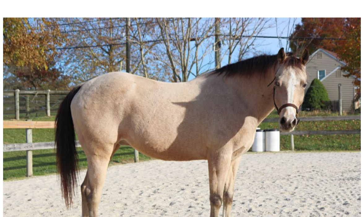
20-year-old Quarter Horse gelding, 15hh

Although Lando Lake is retired from a riding career, he is the ultimate companion horse. "Lando" enjoys attention, is easy to manage, lives outside 24/7, and gets along well with other horses. Lando has done some basic groundwork training and is handled daily. He is a favorite among DEFHR staff and volunteers thanks to his quiet, kind nature. If you're looking for an easy-going gelding to add to your herd, Lando may be your guy.